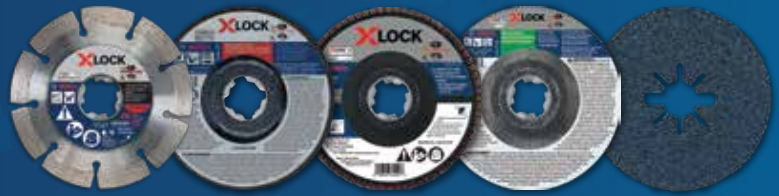
DIAMOND WHEEL CUTTING WHEEL FLAP WHEEL GRINDING WHEEL FIBER WHEEL