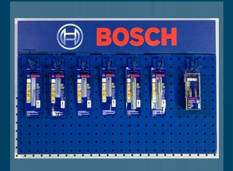
Natural Stone Bits POG