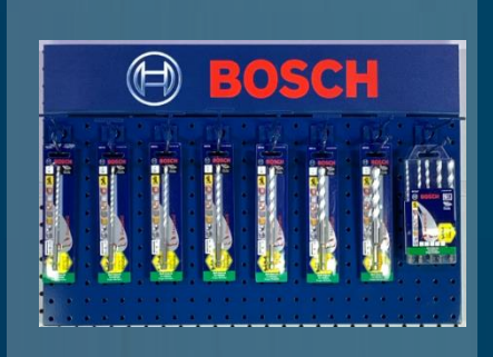
Impact Multipurpose Bits POG