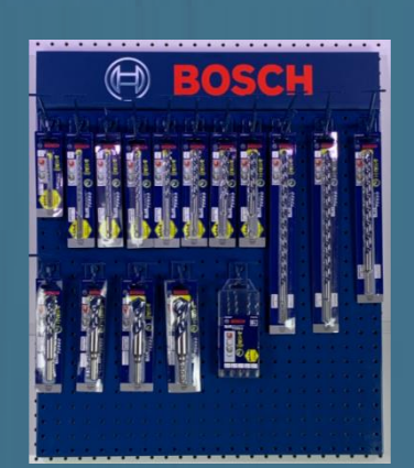
Blue Granite Turbo POG