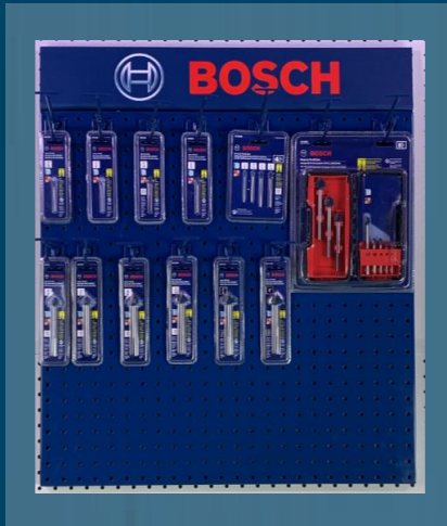
Glass & Tile Bits POG