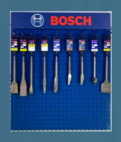
SDS Plus Chisels POG