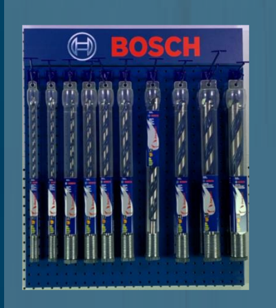
Daredevil Nailkiller 17" Auger Bit POG