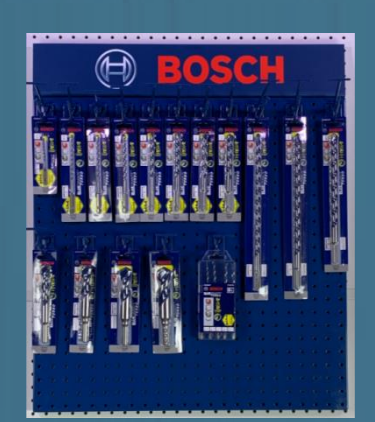
Blue Granite Turbo POG