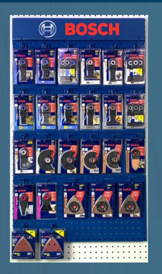
Starlock Oscillating 2' POG