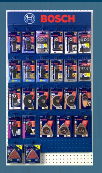
Starlock Oscillating 2' POG