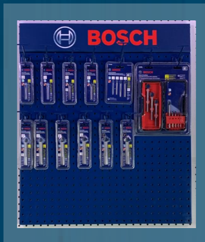
Glass & Tile Bits POG